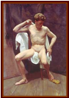
Sir William Dobell Scholarship Nude "Painting is drawing with a brush."