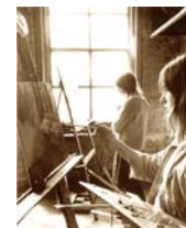
Mining Museum 1968

collection of casts. In 1962 It moved to its present home opposite the Museum of Contemporary Art in George Street.