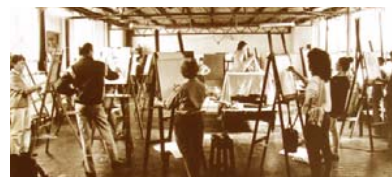
George St before renovation