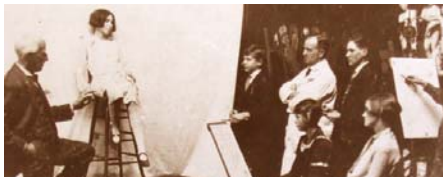
Julian Ashton teaching. Henry Gibbons observing