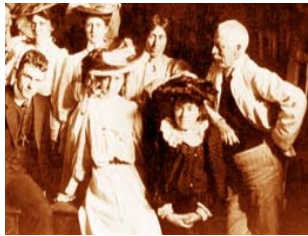
Julian with students