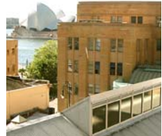
Art school, MCA and Opera House