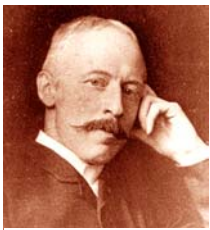
Julian Rossi Ashton CBE