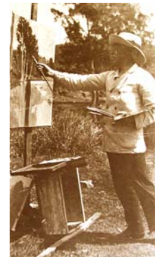
Julian Ashton at Bradleys Head