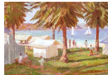
Artist camp reenactment