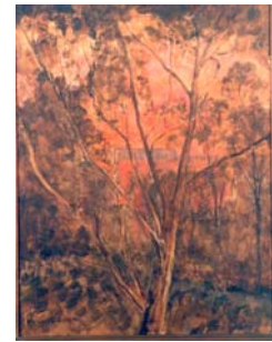
Towards North Head Howard Ashton

The school, which is part of the living history of our harbour conducts classes in this spectacular location – an inspiration to artists and students, young and old who seek to capture the moods of land sky and sea.. Whereas our first students found refuge from the elements under canvas latterday aspiring artists at school are to be found happily at work under the iron roofs of army huts.