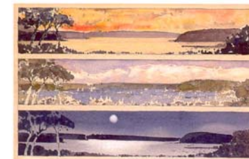
Morning, noon and night

Groups of painters venture forth in most weathers to find vantage points to capture the prevailing sky and sea. Their canvas is as wide as the vista.