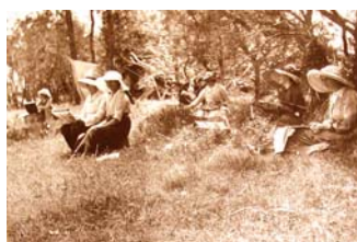
Students at Georges Heights 1880