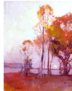
From the camp Sydney Long 1890