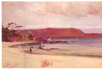
Wyargine Point from the camp