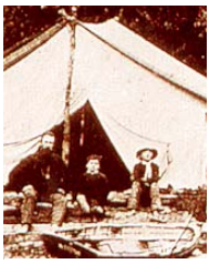
Artist's camp 1880

Julian Rossi Ashton arrived in Australia in 1878. Initially settling in Melbourne he came to Sydney and put down permanent roots at Bondi. As a trustee of the Art Gallery of New South Wales he was responsible for acquiring "Still glides the stream" by Arthur Streeton. The first Australian Impressionist to be acquired by any Australian Gallery