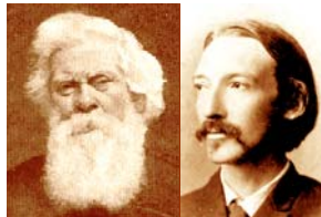
Sir Henry Parkes by J.R. Ashton 1887