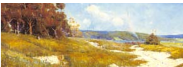
Towards Bradleys Head from the south