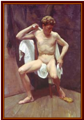
Sir William Dobell Scholarship Nude "Painting is drawing with a brush."