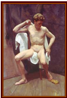
Sir William Dobell Scholarship Nude "Painting is drawing with a brush."